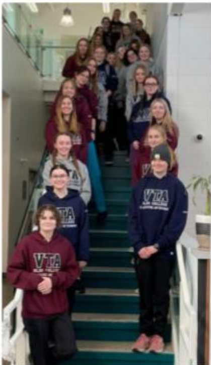
Veterinary Tech - dual credit students

The goal of dual credit is to provide students with skills and experience necessary to transition successfully to post-secondary learning for their career of choice learning. We want students to leave high school engaging in the career pathway that they are passionate about. About 490 Chinook's Edge students enrolled in dual credit this year.